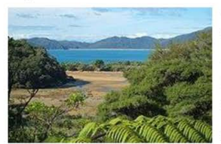
Figure 6 Whenua, maunga, moana. Photo showing New Zealand landscape, ferns and native trees in the foreground, moana in the middle and pae maunga in the background. Blue sky and clouds at the top of the photo.

Finally attachment within Te Ao Māori is centred around wairuatanga. The spiritual