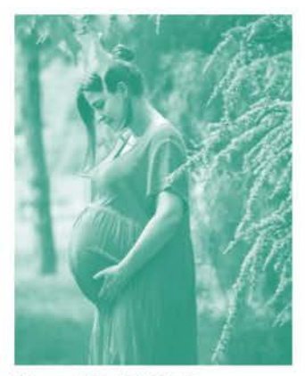
Figure 4 Hapū Māmā Description: in the foreground a Pregnant mother stands outside, holds her belly, while looking down. In the background there are trees.

Māori<sup>53</sup>. Te reo Māori helps to show our uniqueness and to strengthen cultural identity and relationships<sup>54</sup>.