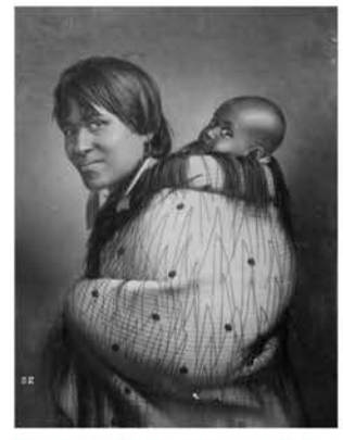
Figure 2- Pare carrying a baby on her back. Partington 1900 Description – a young Māori woman carrying a child on her back. The woman and child are wrapped in a kaitaka.

Once they were born, mokopuna were loved and cared for by whaea. Whaea in Māori is a term used for mother, aunty and female relatives. This word whaea shows that mokopuna were not just the child of the mother. Other women in the whānau had responsibilities. They would care for pēpē and māmā.