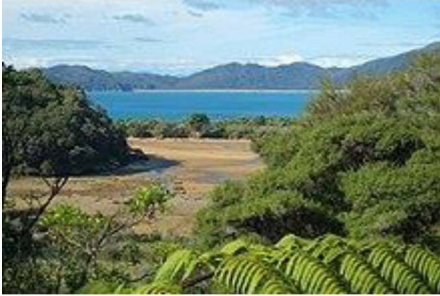
Figure 6 Whenua, maunga, moana.

Finally attachment within Te Ao Māori is centred around wairuatanga. The spiritual