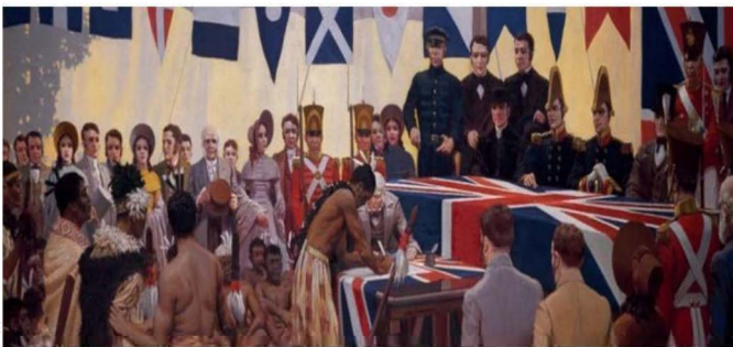
Figure 1 Te Tiriti o Waitangi Signing (1840)

Description: in the foreground a Māori chief is signing Te Tiriti, which sits on top of a British flag. In the background are British dignitaries, British shoulders with guns and Crown representatives. There are other Māori and Pākehā people watching the signing.