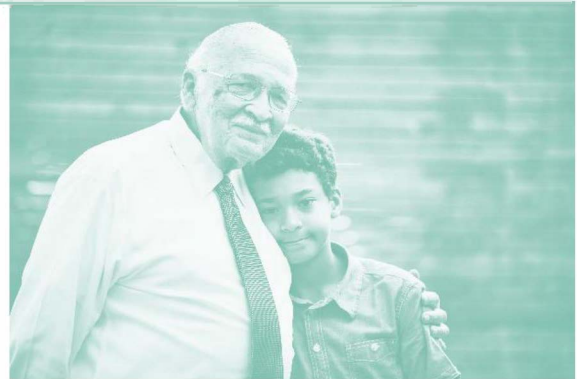
Figure 8 Grandparent with his mokopuna

Description: In the fore ground a grandfather hugs his mokopuna.