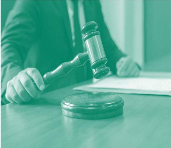
Figure 7 Judge striking a gavel in court.

demanding to be more actively involved with the state 76 . The changes meant that the