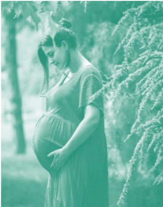
Figure 4 Hapū Māmā

Māori 53 . Te reo Māori helps to show our uniqueness and to strengthen cultural identity and relationships 54 .