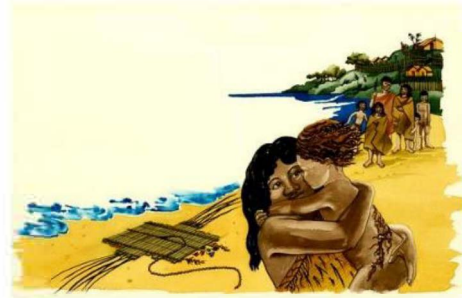
Figure 5 Drawing of a Whāea with mokopuna - Artist unknown.

Whānau are encouraged to return mokopuna to their tūrangawaewae so that their identity can be strengthened. This happens as mokopuna hear the repetition of their whakapapa. As they hear te reo Māori being spoken. As they walk on their whenua. Marae also provide opportunities to return to the important places which has special significance for Māori. The whareniui (meeting house) includes important carvings, photographs, weavings and painting styles which tell the stories of the whānau, hapū, and iwi.